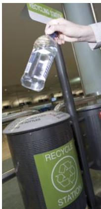
(Left) Low-flow fittings in the bathrooms help conserve water. (Right) Recycling bins are positioned throughout the terminals.